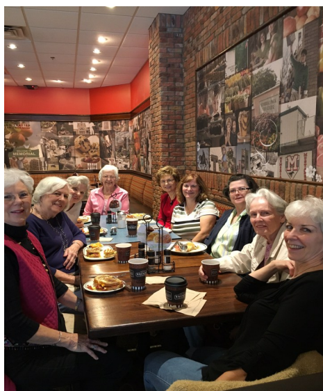
These ladies enjoyed breakfast together at the Corner Bakery Café in March.